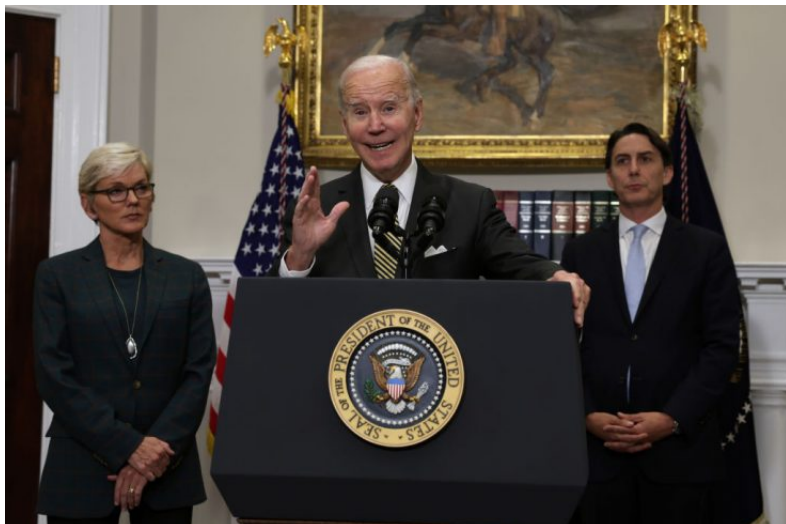
Energy Secretary Jennifer Granholm, President Joe Biden, and energy adviser Amos Hochstein

Energy Department said funding would 'ensure our clean energy future is American-made'